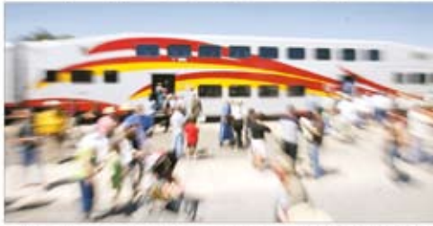
The Santa Fe Railyard's grand opening Saturday brought out more than 1,000 people to take a first glimpse at the redevelopment of the area. The Red Runner train "kissed" a car from the Santa Fe Southern Railway in a symbolic ceremony.

Redevelopment's grand opening brings out community for firsthand look